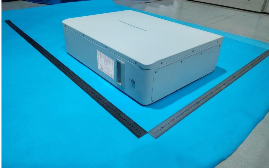
Photo 1 电池组正面 Front view of battery