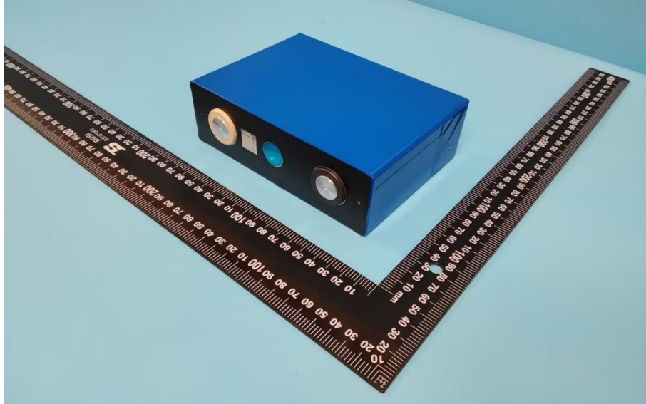
Photo 4 电池正面 Front view of Cell