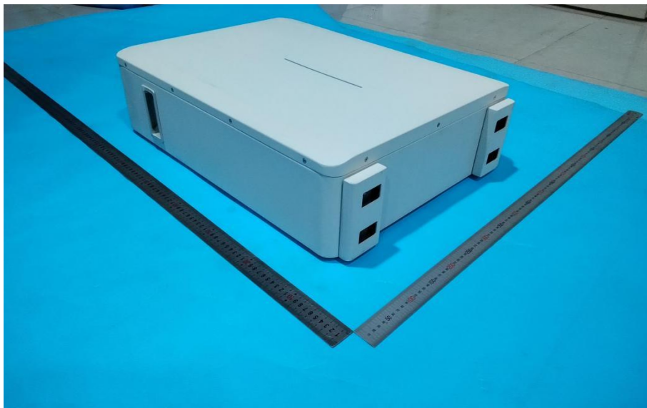
Photo 2 电池组背面 Back view of battery