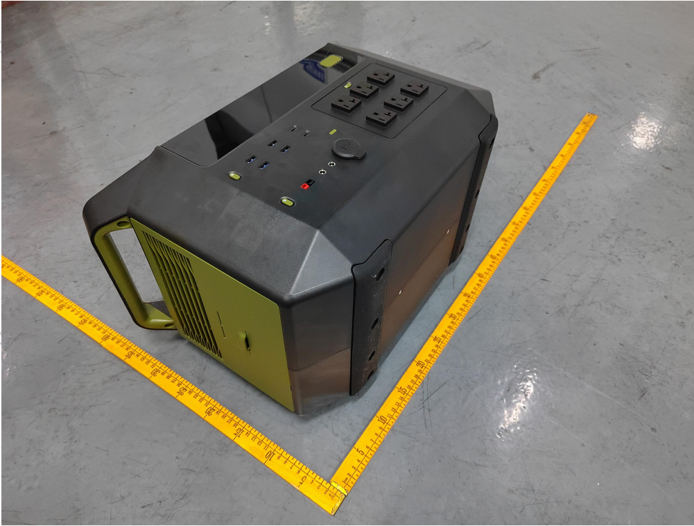
Figure 1 Overall view I of battery (外观图I)