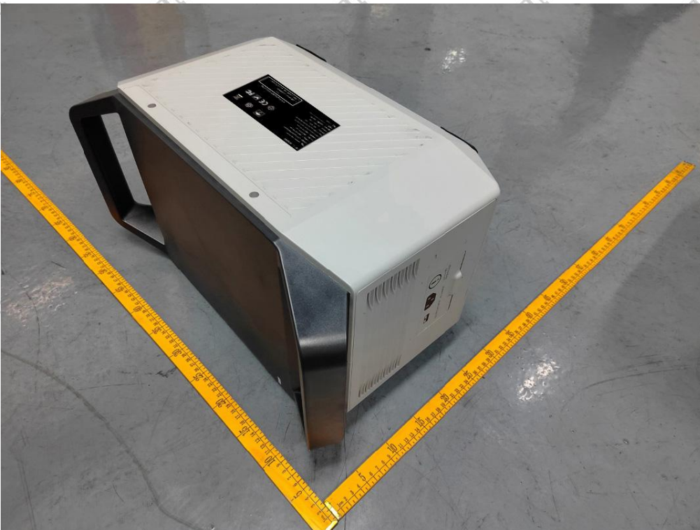
Figure 4 Overall view IV of battery (外观图IV)