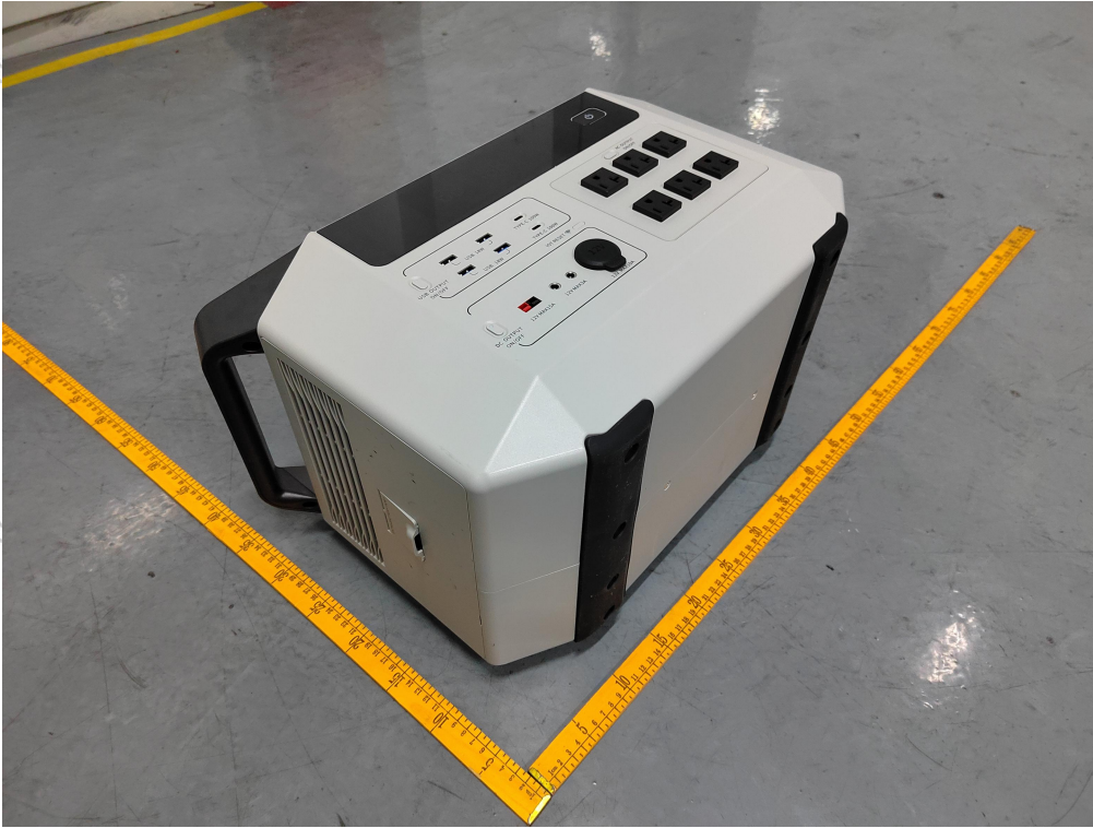
Figure 3 Overall view III of battery (外观图III)