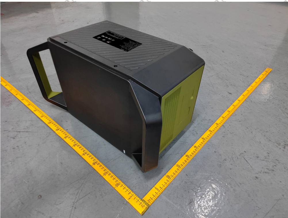
Figure 2 Overall view II of battery (外观图II)